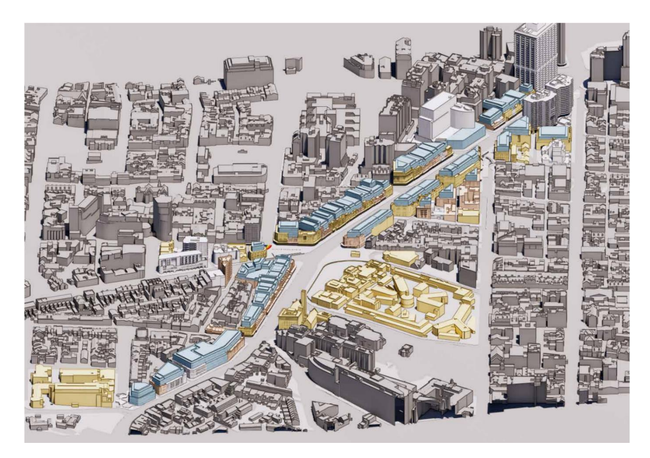
Figure 2 Proposed building envelopes viewed from the north-east